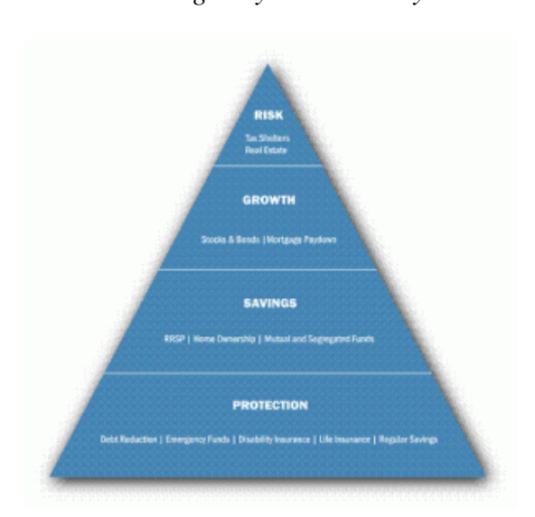
Financial Highway Financial Pyramid

emergency fund, and regular saving; savings (level 2) includes contributions to taxpreferred retirement saving accounts, home ownership, and mutual fund investment; growth/wealth-building (level 3) includes investing in stocks and bonds and mortgage repayment; risk/speculation (level 4) includes taking advantage of tax shelters and investing in risky investments. The FH pyramid recommends that no more than 5 percent of an individual's assets are devoted to risk and speculation.