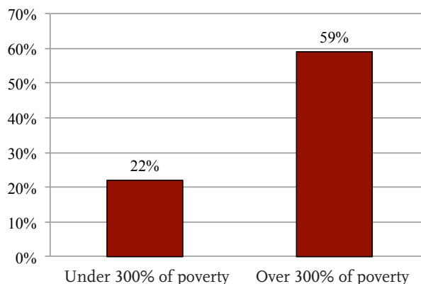
FIGURE 1. AVERAGE PENSION PARTICIPATION RATES FOR INDIVIDUALS AGE 50-58, BY HOUSEHOLD INCOME, 1992-2010

For the core sample of lower-income individuals, the average pension participation rate at a current job was just 22 percent over the 1992-2010 period, well below the 59-percent rate for higher-income individuals (see Figure 1). Within the lower-income sample, those with pensions are substantially better educated, more likely to own their homes, have higher incomes and are more likely to have had a pension in their previous job. They are also more likely to work for a large employer, have a longer job tenure, and be in a white-collar job.