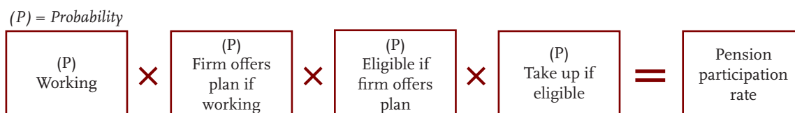
FIGURE 2. PENSION PARTICIPATION CHAIN