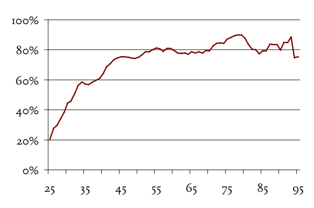
FIGURE 1. HOMEOWNERSHIP RATES BY AGE, 2004

Note: 5-year moving average of homeownership rates. Source : Authors' calculations from the 2004 SCF.