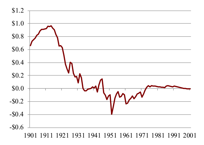
Figure 2. Net Transfers Under Current Law, by Birth Cohort, Trillions of 2016 Dollars