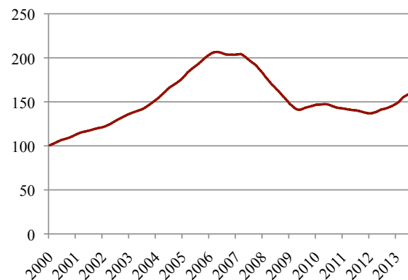
FIGURE 2. U.S. HOUSE PRICE INDEX, 2000-2013 (JANUARY 2000 = 100)

Source: S&P Case-Shiller 20-City Home Price Index (2013).